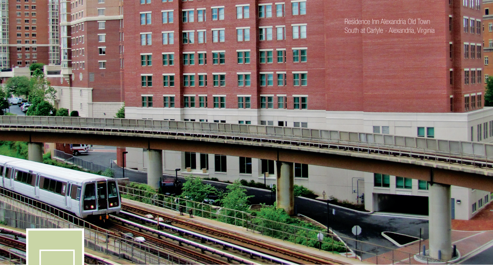
Residence Inn Alexandria Old Town South at Carlyle - Alexandria, Virginia